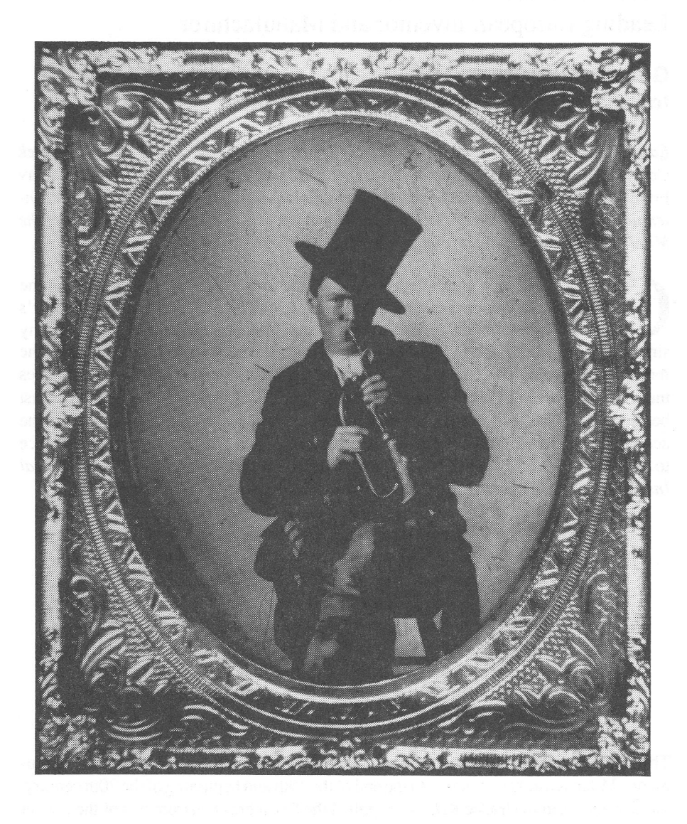
Fig. 4 Tintype of an unidentified American keyed bugle performer. He could possibly be a minstrel show entertainer.