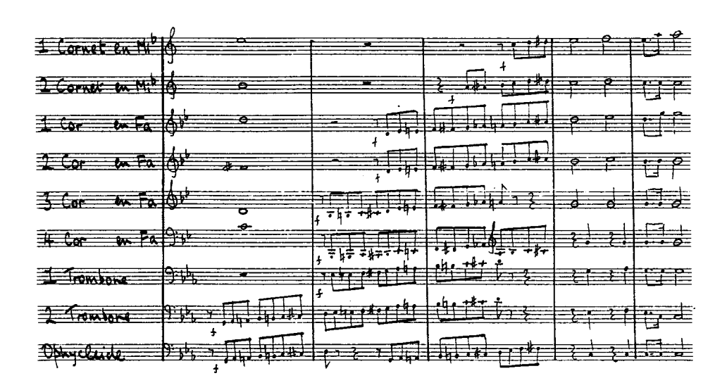
Example 3 mvt. 1