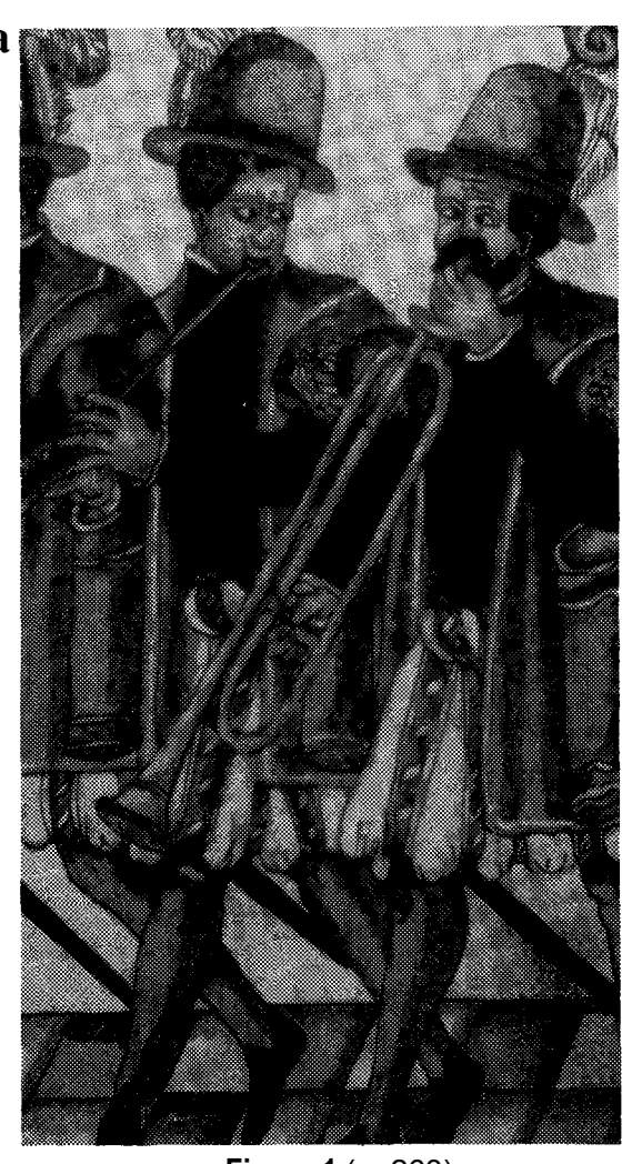
Figure 1 (p. 263) (a) Musicians of Graz in 1568. Vienna, Osterreichische Nationalbibliothek, Handscrhriff 10.116

In John Webb's article "The English Slide Trumpet," HBSJ5 (1993): 262-79, some of the illustrations unfortunately were reproduced too darkly. We apologize for this error, and offer the following sharper (we hope) reproductions. For each, we give the figure number, page number, and original caption as they appear in volume 5.