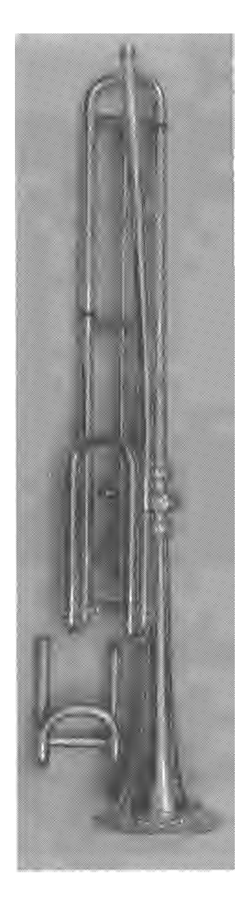
Figure 6 (p. 273) (b) Slide trumpet by John Webb