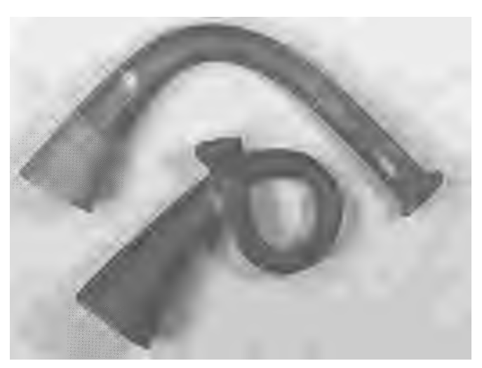
Figure 2 Clay trumpet and horn

century. ^8 It is also known that a glass factory at Montceau near Fontainebleau functioned briefly from 1640 to 1643. ^9