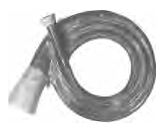
Figure 4 Triple-spiral clay horn