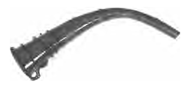
Figure 1 Trumpet of red glass

Eugene Thoison had already taken great interest in the origins and characteristics of these instruments. They most frequently present the profile of a hunting instrument with a more or less pronounced curve; a few of the fragments show, instead, the form of a hunting horn. The surface of the instruments is sometimes smooth, sometimes corrugated. Some have been decorated with a glass paste thread that coils around the piece.