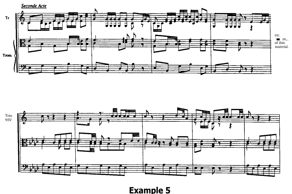
G. Spontini, Alcidor , excerpt from act 2, showing some of the music requiring chromatic trumpet.