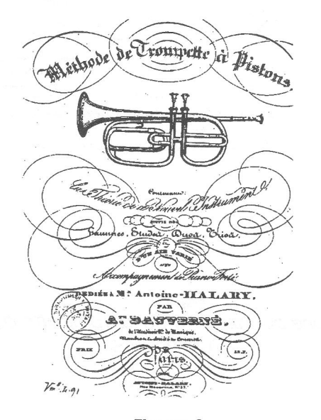
Figure 3 A. Dauverné, Méthode de trompette à pistons (c. 1834-35), title page.