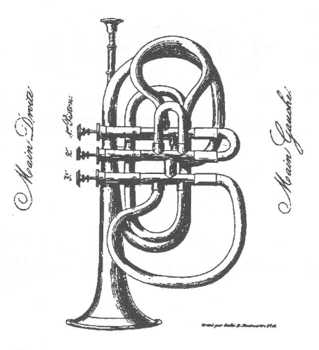
Figure 2 Engraving of a three-valve trumpet from Dauverné's Théorie .