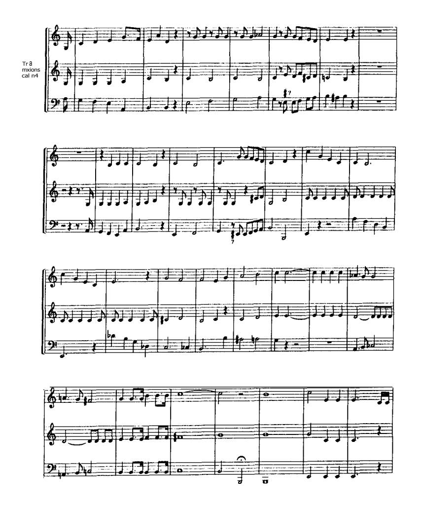
Example 6 H. Chelard, Macbeth, excerpt from trio for three three-valve trumpets.

Example 6 shows that Chelard took full advantage of the theoretical capacities of this instrument.