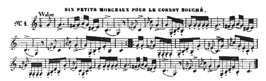
Figure 5 Kresser, Méthode Complète Pour La Trompette D'Harmonie, p. 72.

Kresser's tutor contains a large section for natural trumpet and a smaller one for the so-called petit cornet [little cornet], also a natural instrument. The last three pages of this section is devoted to hand-stopping with the cornet, in a manner similar to that of Cam, mentioned above. The author states that "this instrument uses hand-stopping with three fingers, because the bell is too small for the entire hand." The cornet is tuned in C with crooks for B, Bb, A, Ab, and G; the music is written in low notation. Kresser uses "half-stopping" to produce ft, b, dt, ft, a', and "whole-stopping" for a, d', f', b'. The author also includes fourteen short exercises and "Six petits morceaux pour le cornet bouché" [six little pieces for the hand-stopped cornet], which are rather difficult: