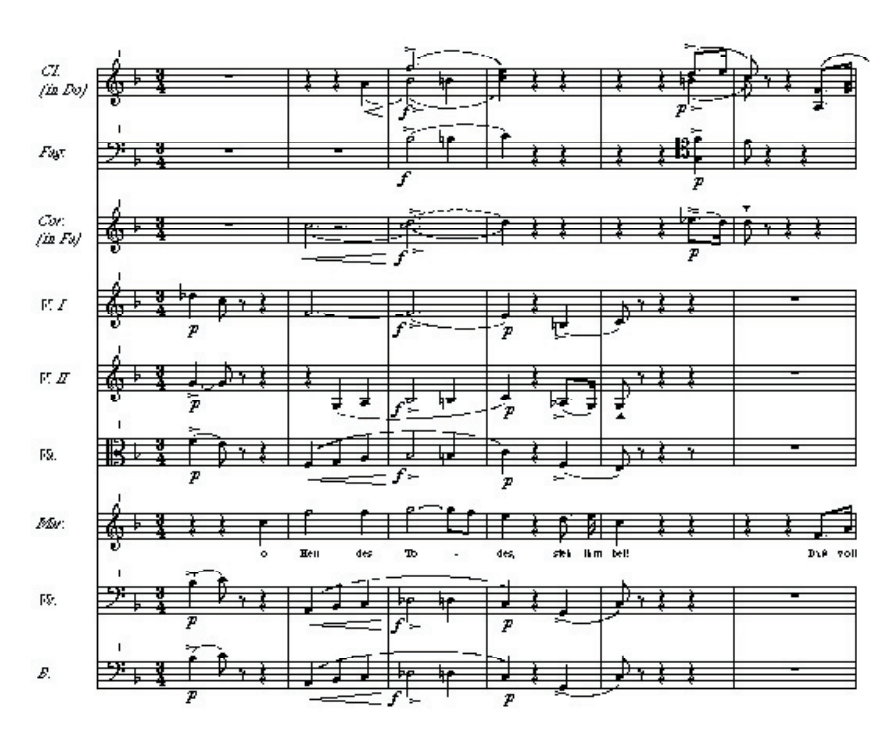
Example 5 Franz Schubert, Lazarus (1820)