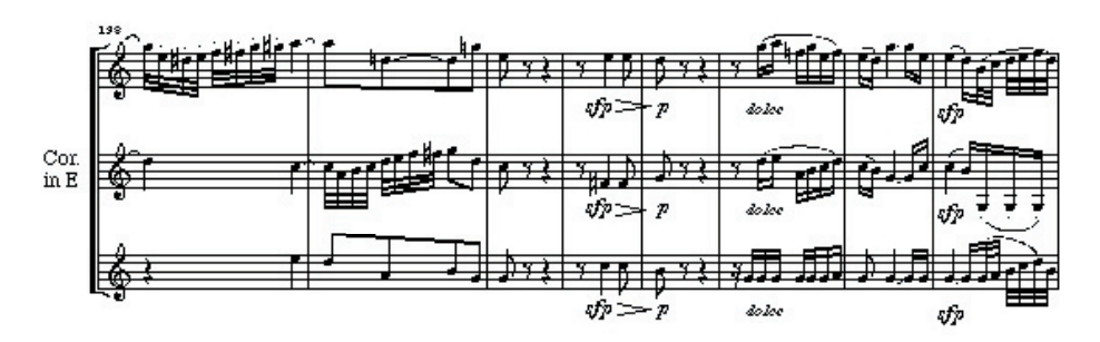
Example 2 Ludwig van Beethoven, Leonore , first version, aria number 11, "Komm Hoffnung" (between 1802 and 1805)

comfortable chromatic use of the valve. This misgiving has unfortunately been confirmed in that even today, important stopped effects are overlooked by valved horn players, largely through unawareness. In an apparently neglected chapter on the valved horn in his otherwise much-read treatise on instrumentation, Berlioz calls the conductor to answer for the correct performance of natural horn parts: