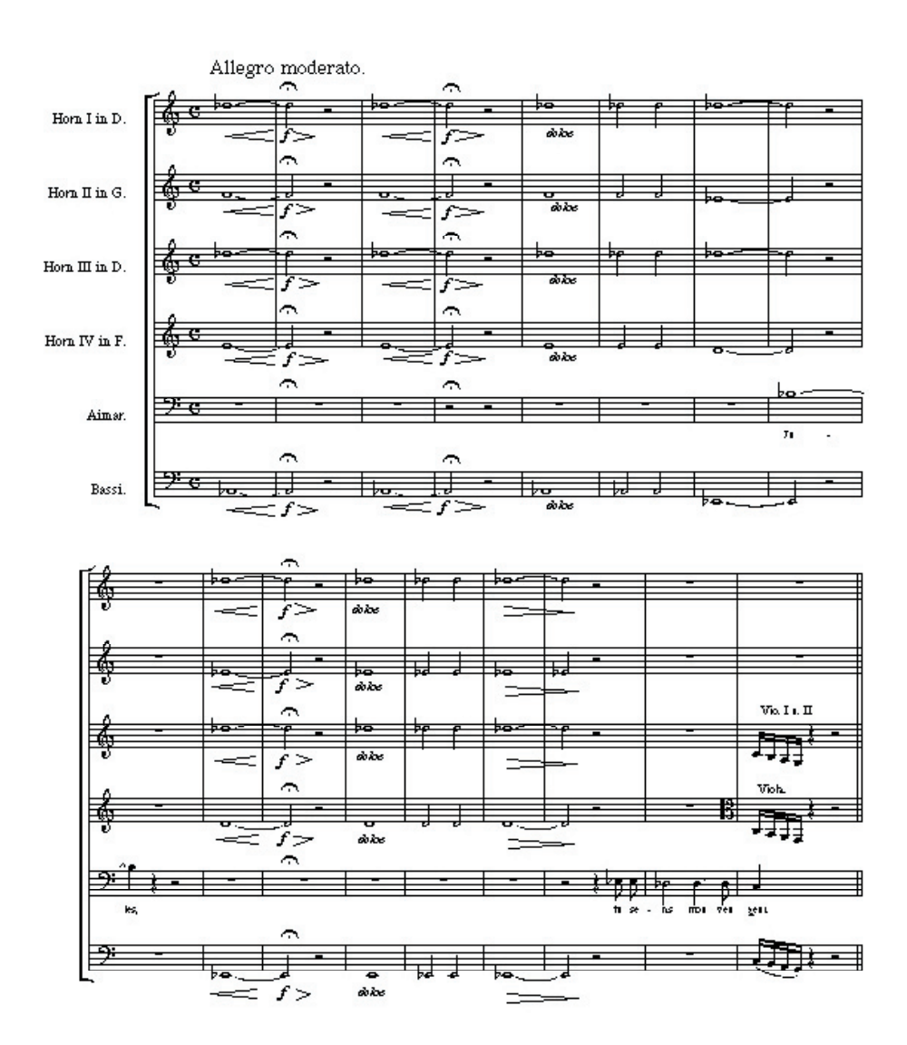
Example 4 Méhul, Mélidore et Phrosine (1794)