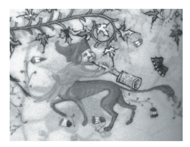
Figure 12 Barrel-bell instrument (detail) from the Hours of Charles the Noble , fol. 240v.