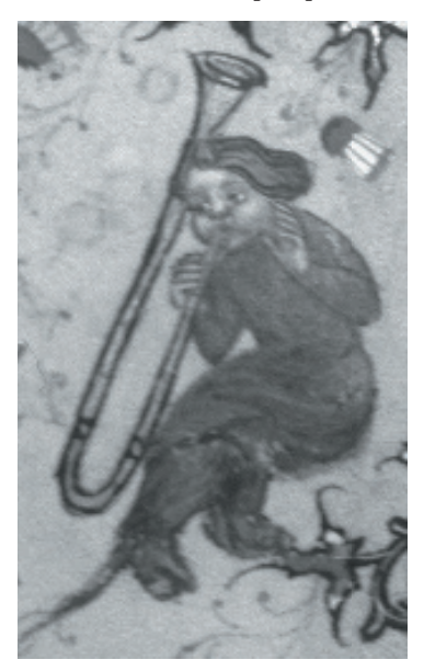
Figure 2 U-shaped trumpet (detail) from the Hours of Charles the Noble , fol. 106v.