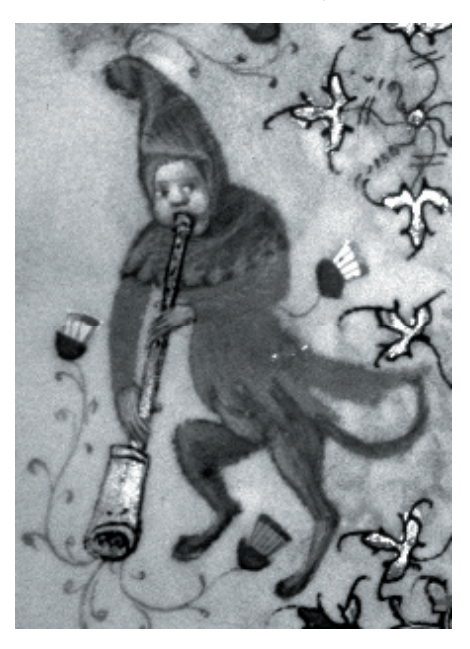
Figure 10 Barrel-bell instrument (detail) from the Hours of Charles the Noble , fol. 118v.