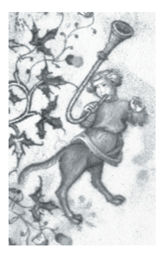
Figure 3 U-shaped trumpet (detail) from the Hours of Charles the Noble , fol. 272r.