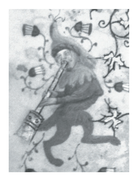
Figure 9 Barrel-bell instrument (detail) from the Hours of Charles the Noble , fol. 101v.