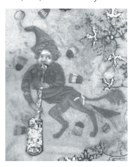
Figure 8 Barrel-bell instrument (detail) from the Hours of Charles the Noble , fol. 53v.