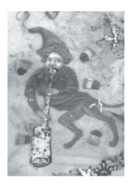
Figure 7 Barrel-bell instrument (detail) from the Hours of Charles the Noble , fol. 52v.