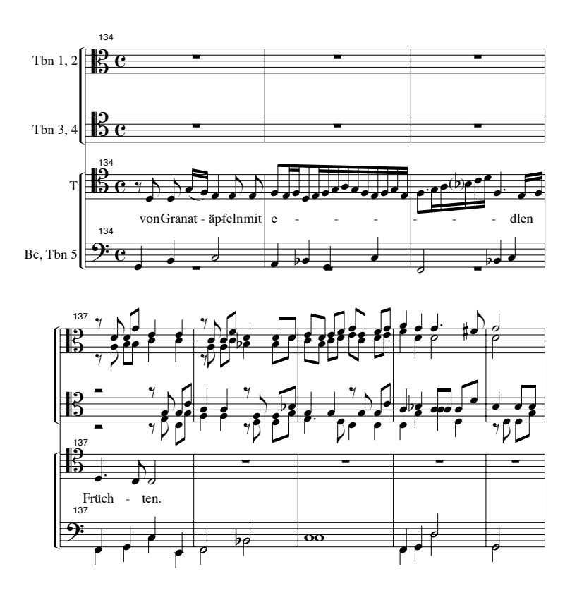
Example 9 J. R. Ahle, Salamonisches Liebes Gespräch (mm. 134-41)

The last few measures of the solo and the first few of the trombone postlude are provided in Example 9.<sup>56</sup> The lushness and richness of the timbre of the homophonic trombones, which covers almost the whole compass available for the instruments (C to a'), helps to conjure up a sensuous image of the maiden through the image of the fruit. The cori spezzati like imitation between pairs of trombones in the postlude seems to provide an enthusiastic affirmation of the tenor's virtuosic solo.