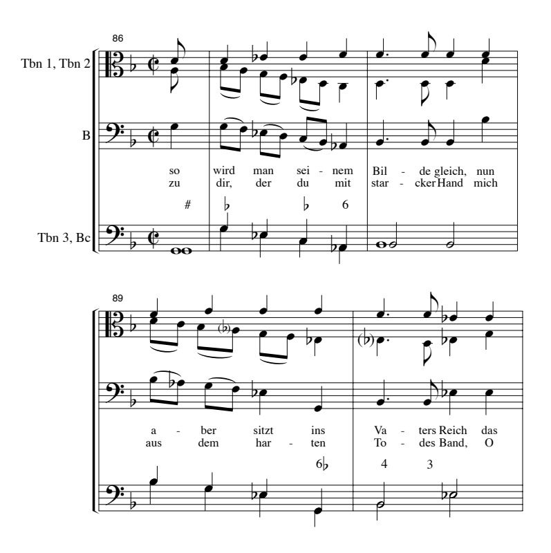
Example 16 Fabricius, O liebes Kind (1; mm. 86-90)

The title of the collection, Geistliche Arien, Dialogen und Concerten (1662) confirms that the composer saw the aria as being distinct from dialogues and concertos. The coro grave is clearly used in verses 2, 4, 7, and 9.<sup>74</sup> The trombones' accompaniment to the solo alto and solo bass is homophonic and fills in between the vocal phrases. One notable exception is that in verses 4 and 9, Trombone 2 joins in a duet in thirds with the bass twice in three measures (mm. 87-89), thus focusing attention on the cadence, to the words "Vaters Reich" ("Father's realm") for verse 4 (mm. 90) and "Todes Band" ("death's bonds") on the repeat of the music for verse 9. The trombone is to imitate the voice as exactly as possible in these runs, as slurs are indicated for the trombone, above each pair of eighths that correspond to a melisma in the bass. The bass voice part exhibits these slurs as well (see Example 16).