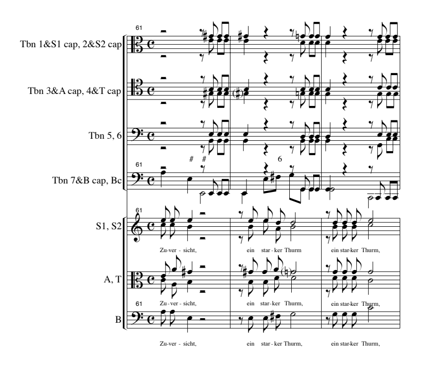
Example 10 J. R. Ahle, Höre, Gott (9; mm. 61-63)

Enhancing a unique text means that the low choir is selected to distinguish unusual texts or concepts within a larger work that may have an altogether different overall Affekt . The change in texture to the timbre of trombones with a voice then stands out as a contrast to the surrounding music. For example, Kuhnau's cantata Es steh Gott auf , a setting of Psalm 68:2, is organized in five movements; an opening tutti is followed by three solo vocal movements, framed by a return to the opening tutti. <sup>59</sup> The overall mood for this Easter cantata is jubilation. A coro grave of three trombones accompanies the second soprano's recitative, which states,