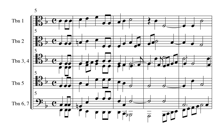
Example 8 Knüpfer, Der Herr ist König (mm. 5-9; trombones only)<sup>54</sup>

Trombones are sometimes used without voices to establish the overall mood of a piece in the opening sinfonias. The trombones share the beginning of Knüpfer's Der Herr ist König with strings. This composition is an extraordinary setting of Psalm 93 for eight voices, seven strings, and seven trombones. In the opening sonata, the first five measures are for the strings, followed by four and a half measures for seven trombones (see Example 8), after which both groups sound together. This passage, filling almost the entire range of the trombone from AA to f^{\,\prime} , is not only dark and rich, but is unmistakably masculine and kingly in sound. The trombones are also used to highlight two images of water later on in the piece.