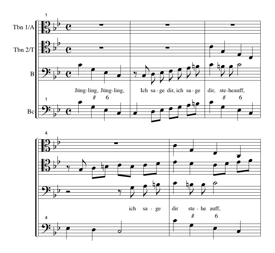
Example 11 Hammerschmidt, Jüngling ich sage dir (19; mm. 1-5)

The trombones were selected because the despair and death in the text brought their timbre to mind. Their accompaniment is scalar and sustained, with the descent at its lowest on the word "Grabe" (m. 50). The texture does not change until the brief imitation in eighths at the final cadence (see Example 12). Rimbach describes this as an "unusual accompaniment." That Kuhnau associated the timbre of different instruments with specific verses of the text is confirmed in the next two stanzas. Two violins accompany the first soprano's more comforting, yet melancholic verse explaining that with Christ's death, a way will be found through the enemies. Two clarini share the jubilant setting of the third verse with the bass, which mentions Christ's triumph over death.