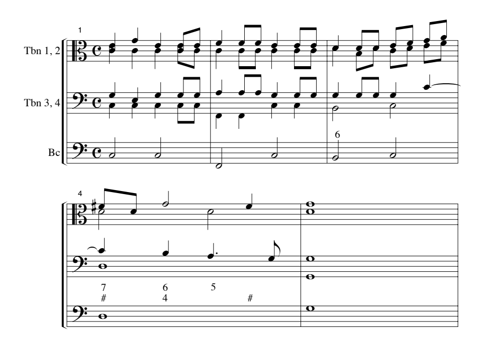
Example 14 J. R. Ahle, Zwingt die Saiten in Cithara (5; mm. 1-5)

hovering primarily between e^t and c^2 . The brightness of the sound in the upper register of the trombone was probably selected by Schelle to match the soprano and draw attention to the words of the angel. A clarino would not have had the chromatic or technical flexibility, and the sound would have been too overpowering. On the other hand, the cornetto would have been neither bright nor loud enough.