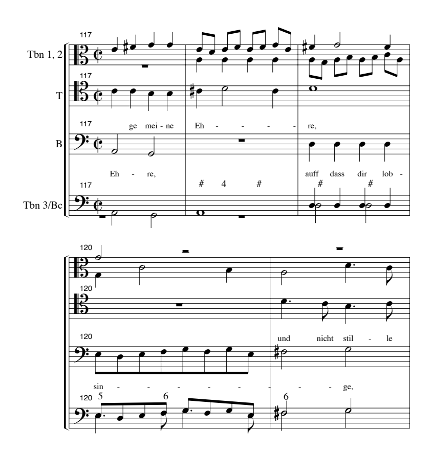
Example 6 Hammerschmidt, Herr höre (15; mm. 117-21)

Trombones are not integrated into the structure of the twenty-two trombone motets from this period in the complex manner of Schütz<sup>49</sup> or Gabrieli,<sup>50</sup> and usually remain separated from the voices except in the tuttis and cori grave . Five structural roles are demonstrated, whereby the trombones: