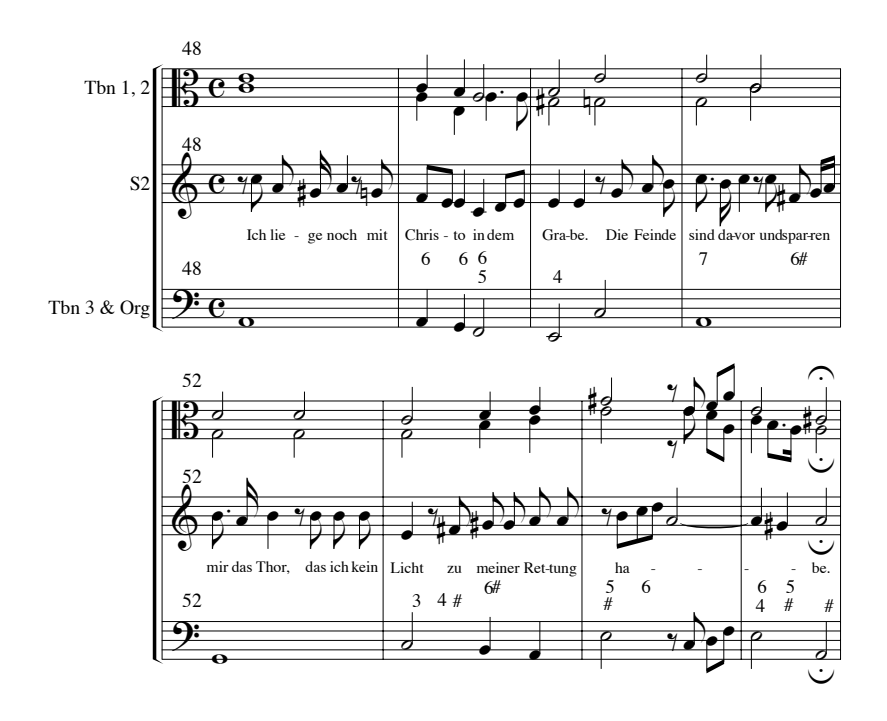
Example 12 Kuhnau, Es steh Gott auf (mm. 48-55)

Interestingly enough, these associations between timbre and text are used to highlight multiple textual contrasts within one piece, as well as for larger structural purposes. J. R. Ahle's Erschienen ist der herrliche Tag (29 - 1658), not only presents the coro grave in a warlike passage, but also in ones involving grief, death, and joy, each set for a different vocal solo or group.<sup>61</sup>