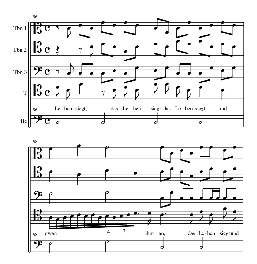
Example 13 J. R. Ahle, Erchienen ist der herrliche Tag (29; mm. 96-99)

Finally, in the sacred music composed in the latter part of the century, a single trombone is called upon in four compositions to enhance a particular text. One example, Kuhnau's Laudate pueri , has already been described above (see Example 3). This next example also reveals the advanced technical demands that the trombonist was called upon to execute in this period.<sup>66</sup> An imitative duet for alto trombone and soprano is set to the angel's announcement, "Be not afraid; for behold, I bring you good news" (Luke 2: 10-12) in Schelle's Actus musicus , usually with the voice playing the role of dux . Only towards the end of the duo does the trombone lead the voice (mm. 27, 32–see Example 15).<sup>67</sup> The trombone imitates the octave leaps (mm. 24, 28) proffered by the soprano, as well as the quarter-note runs (mm. 15-16). The piece lies in the upper tessitura for the alto trombone,