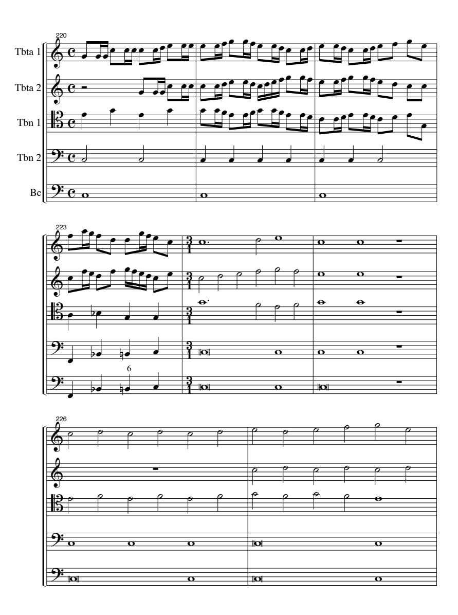
Example 5 J. R. Ahle, Gloria in excelsis Deo (10; brass parts only, mm. 220-27)