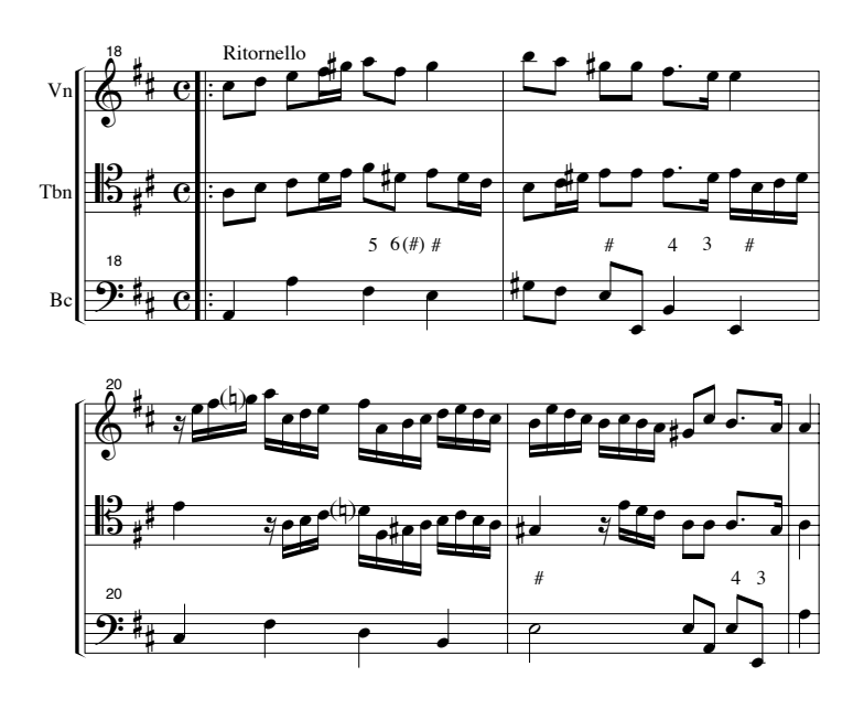
Example 2 Briegel, Du Tochter Zion (18; mm. 18-22)

The obbligato trombone is sometimes treated equally with another instrument or voice in duets, or with other instruments or voices in other textures.<sup>39</sup> In Briegel's Du Tochter Zion (18 - 1684), the violin and tenor trombone play homophonic duets throughout. In the opening tutti the instruments introduce and punctuate material together against the SATB choir (mm. 5-17),<sup>40</sup> occasionally in echo imitation of the voices (rhythmic rather than melodic imitation predominates—see mm. 7 -14). The ritornello, as shown in Example 2, demonstrates the similar technical treatment of both instruments (mm. 18-22). Although the first two measures commence with a homophonic duet, imitation in a sixteenth-note pattern occurs between the instruments once the trombone initiates this motive on beat four of measure 19. The violin does receive more notes, and the trombone more rests, but the effect of the duet is of equal partnership.