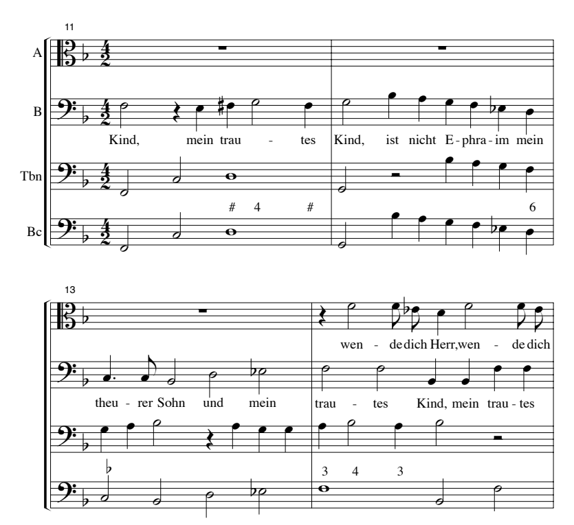
Example 1 Hammerschmidt, Wende dich Herr (20; mm. 11-14)

30), where the soprano joins to make a trio. This flexible use of the trombone adds significantly to the textures possible within the apparent confines of a continuo dialogue. The instrument maintains this dual role as both tenor and bass voice in all of Hammerschmidt's other dialogues from Dialogi oder Gespräch (1645) with the exception of two, in which the instrument maintains its bass line role.<sup>36</sup>