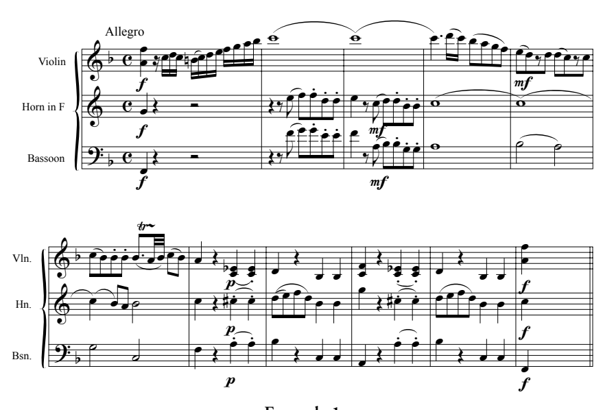
Example 1 Franz Danzi, Op. 23, first movement; mm. 1-10.

The initial measures of the Allegro give immediate precedence to the violin in a vigorous ascent reminiscent of the Mannheim symphonic rocket. At measure 7, the horn briefly takes melodic control, only to be interrupted by a restatement of the opening motive by the violin (Example 1).