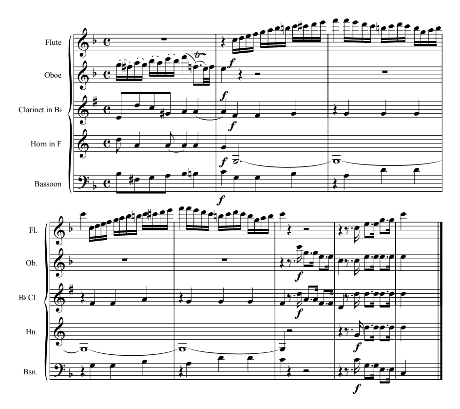
Example 7 Danzi, Op. 68, first movement, mm. 18-25.

cal establishment. It was not until 1807 that he took up another court position, this time at Stuttgart. From a comparison of dates of surrounding opus numbers, it seems that the Trio dates from this peculiar lacuna in Danzi's official life, circa 1800 to 1805.<sup>6</sup>