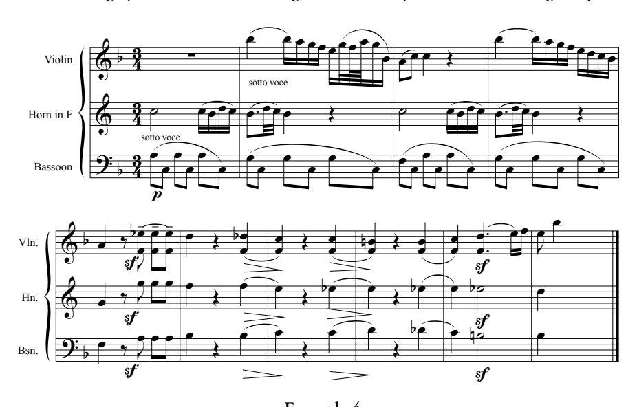
Example 4 Op. 23, fourth movement, mm. 11-20.

Even more striking in this regard is the fourth movement, the Larghetto. Throughout this expanded binary form the violin and horn exchange delicate phrases. While the violin maintains a high profile because of its range and constant presence, the horn is given pitches