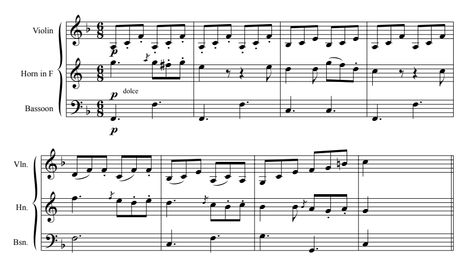
Example 5 Op. 23, sixth movement; mm. 1-8.

The first minuet is unremarkable for the horn player, but gives the bassoon much longer solo passages than in any other movement, with the exception of the theme and variations. The second minuet exploits the open pitches of the horn to such a degree that the horn seems to evoke not only its hunting ancestry, but its contemporary orchestral style as well. Likewise, the rondo features the horn with a hunting type of melody in compound meter, and the only instance of the characteristic "horn fifth" in the entire work (Example 5).