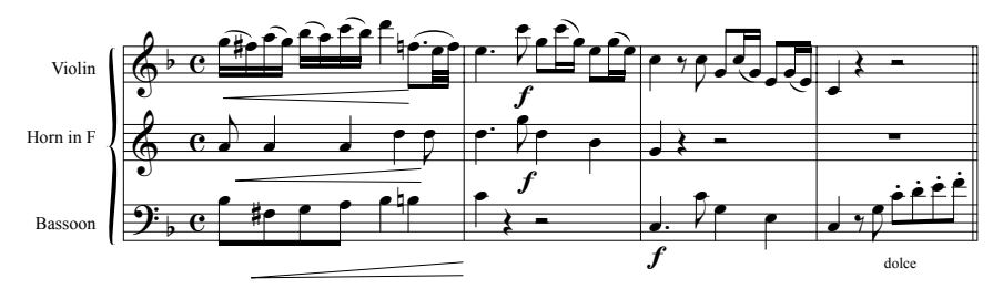
Example 2 Op. 23, first movement, mm. 18-20.

The bridge to the second thematic area offers a view in miniature of Danzi's careful exchange of melodic materials. The bridge, a phrase extension of the restated opening theme, concludes with a C-major arpeggio. The horn underscores the eighth and sixteenth notes in the violin, echoed by the bassoon an octave lower (Example 2). These measures demonstrate nicely the register overlap between horn and bassoon, as well as the way in which the slower note values consistent with the horn can be combined with the agility of the violin.