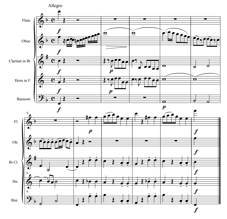
Example 6 Danzi, Op. 68, first movement, mm. 1-11.

The most obvious large-scale change is the reduction of movements from six to four, eliminating the Larghetto and the first minuet. The wind quintet of the time followed the established model of string quartets of Haydn's later years in using for its four movements a sonata form, a slow movement in ternary form or theme and variations, a dance, and a rondo. In Danzi's quintet version of this piece, the first movement itself is transformed, with significant additions and deletions of material. In the exposition, while the presentation of the first tonal area remains intact, the bridge to the second tonal area is expanded from three measures to six measures. The second theme is stated twice in the trio version, but only once in the quintet version, as though the quintet players had made a cut from