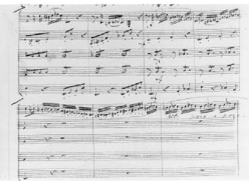
Figure 7a and b

From the Introduction to B. Crusell's Theme and Variations , op. 12. Arrangement for brass quintet, dated 19 February 1859, by C.J. Nylén, who was later to become leader for one of Crusell's bands in Linköping. Statens musikbibliotek (the Swedish State Library of Music), Series I:6043, acquisition number 1932/1455.