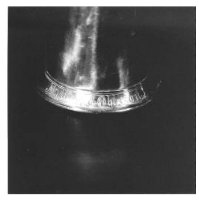
Figure 4b Bell garland of the Eb kornett by Ahlberg & Ohlsson, in Figure 2a.