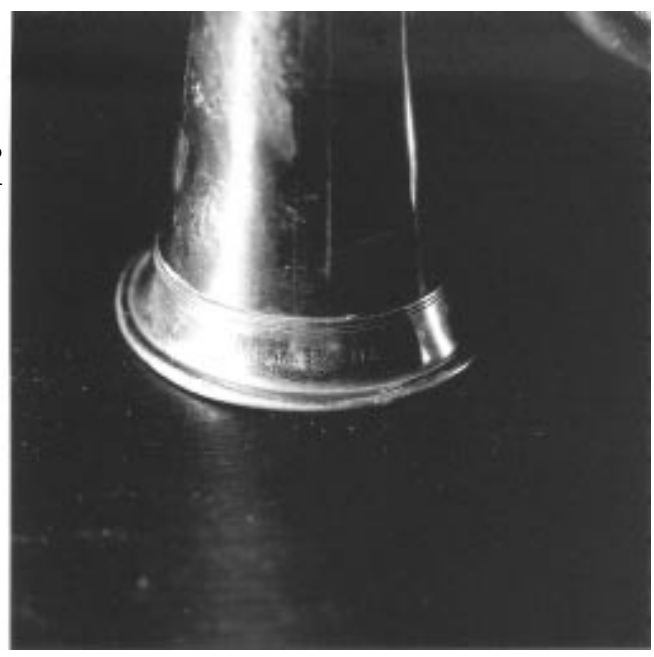
Figure 4a Detail of the Eb kornett by Wahl in Figure 2a. Engraved with trade mark "I.V. WAHL."