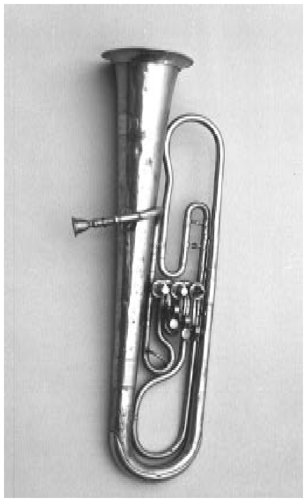
Figure 8c Tuba (in Bb) by I.V. Wahl. Engraved "I.V. Wahl. Land-skrona" on an oval plate on the bell. (Part of the valve mechanism is damaged.) Kulturens Museum, Lund, K.M. 44 587.

task. The tenorbasun was given the nickname "brass cello," because of its customary role of playing melodic countermelodies.