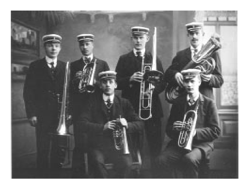
Figure 6 Amateur brass sextet "Liljan," appr.1908, with instruments from I.V. Wahl. Landskrona museum, L.M. 1924.

soon found to be indispensable in mills, as well as in the temperance movement, the free churches, and the labor unions (see Figure 6).<sup>24</sup> These early bands cannot be considered "folk music" ensembles, any more than the repertoire they learned from the military musicians who were employed as their instructors.