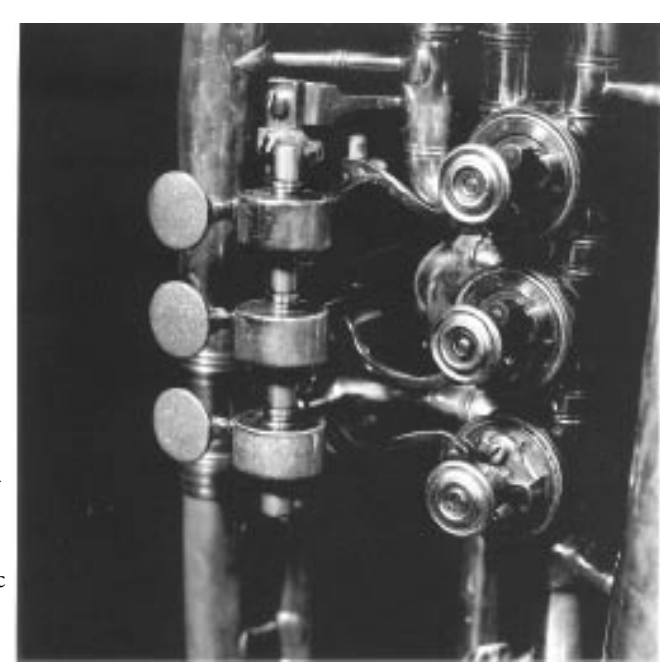
Figure 3b Detail of the Eb kornett by Ahlberg & Ohlsson in Figure 2a.