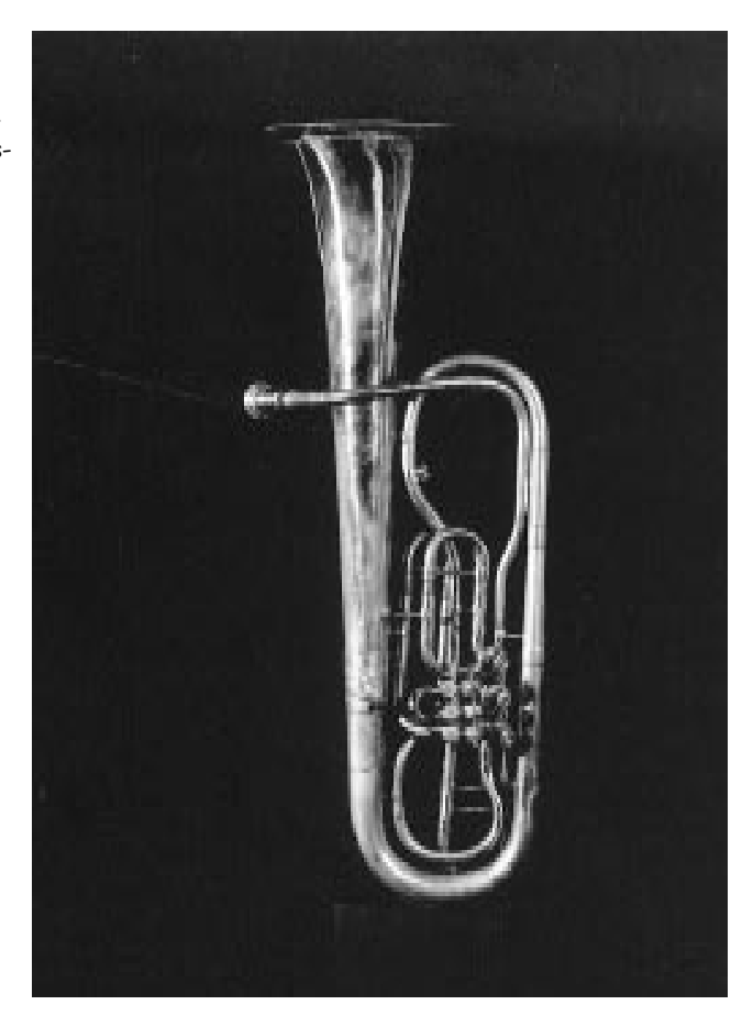
Figure 8b Tenor tuba by Ahlberg & Ohlsson. Private collection (Christer Torgé).

The substitution of the valved tenor trombone for the tenor horn, or tenor tuba, as a solo instrument can be observed in handwritten parts of old arrangements. Here one occasionally encounters obbligato cantabile tenor parts that today we regard as essential parts of a march, for example, that are not in the original arrangement, but were added later, in another hand. I have also seen parts for this instrument, dated as late as 1880, written in tenor clef. This may be a reminder of this instrument's heritage, relating to the tenor tuba, whose parts originally were written in tenor clef. Early on, tenor tubas primarily played accompaniment parts, often supporting the bass, as did the tenorbasun in early octets. The first of the two alto horns sometimes played a role similar to that assumed later by the solo valved trombone.