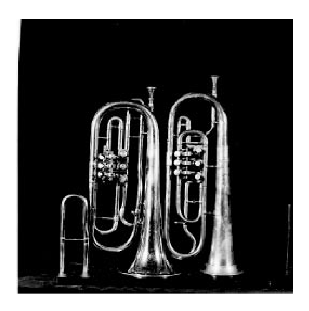
Figure 2b Left: alto horn in Eb by Ahlberg & Ohlsson (ca. 1900?, serial number 388, with extra crook for "Swedish fingering"). Instrument in author's possession. Right: alto horn in Eb by I.V. Wahl. The Music Museum, Stockholm, F 107.