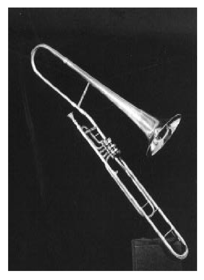
Figure 8a Tenor valve trombone (tenorbasun) by Ahlberg & Ohlsson, made between ca. 1900 and 1910 (detail, see Figure 9). Private collection (Christer Torgé).

There were tenor instruments (transposing instruments in Bb) of different kinds, as indicated above: valved trombones and tenor horns in kornett shape as well as in tuba form. Also, the tenor trombone was built in different forms. Bore sizes varied, as did the ratio of cylindrical to conical bore. Especially characteristic of Swedish bands and ensembles was a solo tenor valved trombone ( solotenorbasun or -ventilbasun ), developed during the latter half of the nineteenth century, of somewhat narrower bore than the ordinary valved trombone. (See Figures 8a and 9).