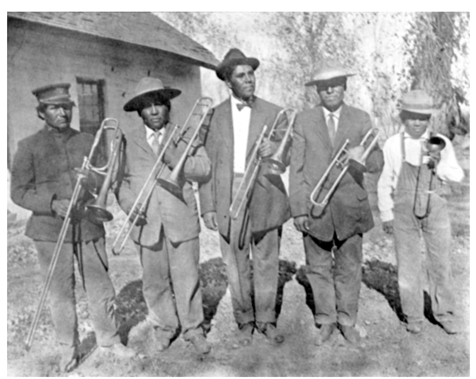
Figure 2: The trombone choir at the Martinez mission, 1911. Proceedings of the Society for Propagating the Gospel Among the Heathen , 1911, frontispiece.

In spite of Brother Delbo's lament that no Indian could be found to play the soprano trombone, a photo that accompanies the above report graphically illustrates that not one, but two members of the native population were persuaded to take up that instrument (see Figure 2).