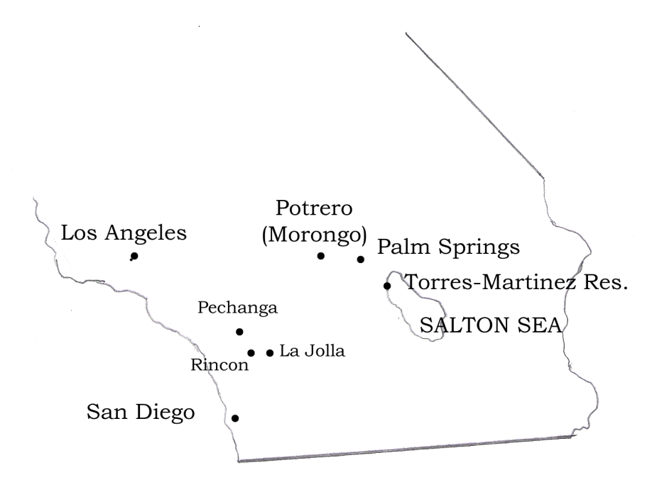
Figure 1: Schematic map of southern California, showing locations of Moravian missions in relation to major cities.

diverted water from the Colorado River, some 50 miles to the east, into the Basin. In 1904 the entrance to the canal silted up, thereby stopping the flow of water. Engineers created a new diversion of the Colorado River in order to compensate for the water lost to local agriculture, but soon the river flooded, escaped its banks, and changed course. It flowed into the basin, destroying a chain of small lakes, thereby threatening the incipient agricultural industry in the valley. The Salton Sea continued to grow in size until the Southern Pacific Railroad closed the breach in 1907. The Rev. W.H. Weinland, superintendent of the Moravian missions in the region, feared that the rising water level might force the residents of Martinez to relocate to Potrero. The floods and the ensuing efforts to close the breach were recounted in a popular novel of the time, Harold Bell Wright's The Winning of Barbara Worth .